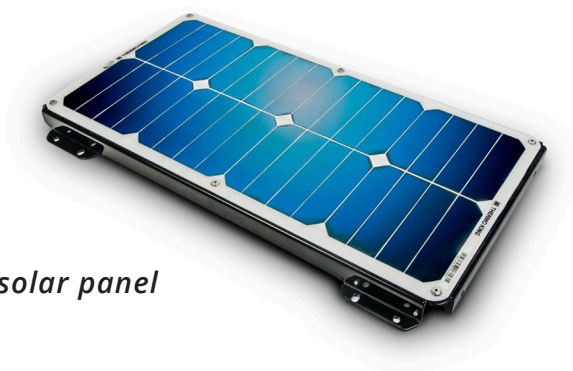
30W solar panel

ThermoLite® solar panels deliver clean, reliable performance resulting in longer battery life, lower fuel consumption, and reduced emissions. Given these potential benefits, ThermoLite solar panels can be an important part of a comprehensive sustainability program for any business.