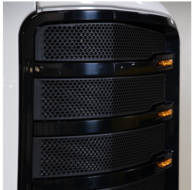
original grille style

For customers looking to further enhance their fleet's appearance, chrome and LED options are available.